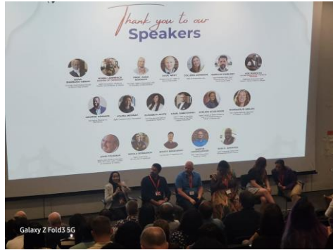
Galaxy Z Fold3 5G