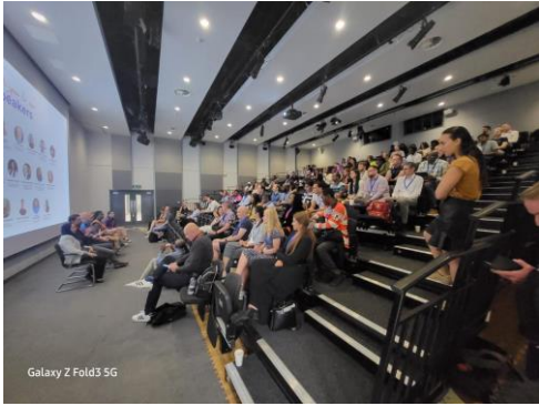
Galaxy Z Fold3 5G