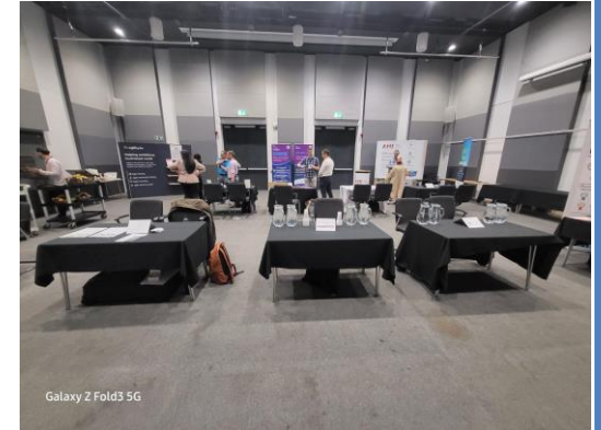
Galaxy Z Fold3 5G