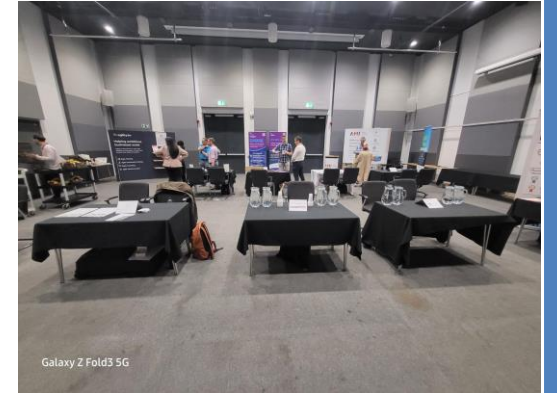
Galaxy Z Fold3 5G